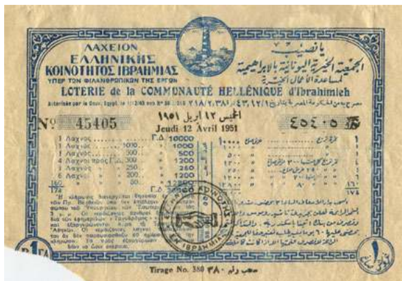
9. A lottery ticket issued by the Greek community organization in Ibrahimiya in April 1951 to support fundraising for its philanthropic activities.