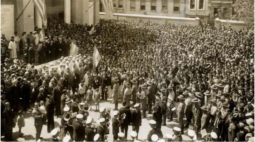
7. March 25 celebration (Greek Independence Day), sometime in the 1930s, at the Greek Orthodox Church of Constantine and Helen in Bulaq, Cairo. Near the church steps in white uniforms are the students of the Achiloupoulio Women's School; in the foreground are the Cairo Philharmonic and the Greek Boy Scouts bands.

the wake of the 1952 revolution until the exodus of the early 1960s; and a final chapter considers the passionate ways the Greeks of Egypt who resettled in Greece have promoted their history in Egypt, kept the memories of that past alive, and demonstrated a profound sense of nostalgia and affection for both Egypt and the Egyptian people.