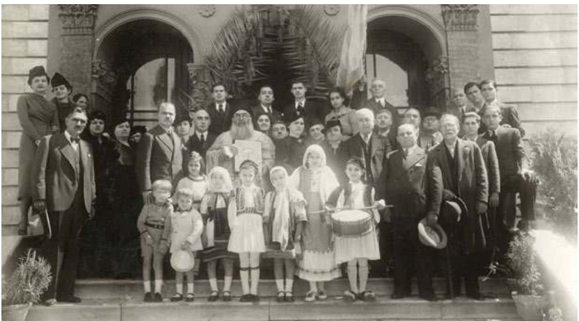
8. Visit of Christophoros II, Greek Orthodox patriarch of Alexandria, to the Greek community in the Nile Delta town of Mit Ghamr, 1950s.